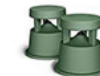
FreeSpace® 360P Series II loudspeaker