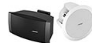
FreeSpace® DS 16S, DS 16SE & DS 16F

AVIS-Tech services includes; providing of design solution, technical assistance, installation and commissioning, product supply and procurement and after-sales service maintenance of all represented brands in the market. We provide site assistance and technical support for all a/v needs from design stage up till implementation and maintaining the whole solution.