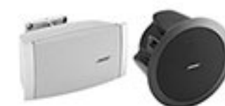
FreeSpace® DS 40F & 40 SE