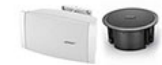
FreeSpace® DS 100SE & DS 100F