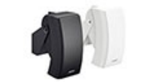
Panaray® 302" A loudspeaker