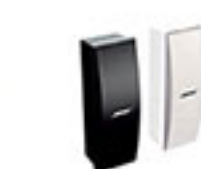
Panaray® 402" A loudspeaker